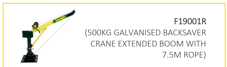
F19001R (500KG GALVANISED BACKSAVER CRANE EXTENDED BOOM WITH 7.5M ROPE)